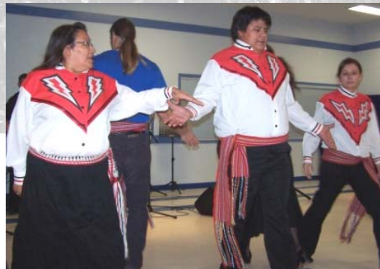
Regina Reelers (above)